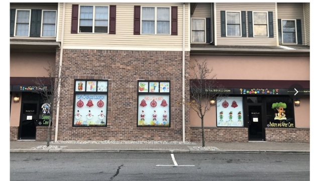
Preschool Learn Time