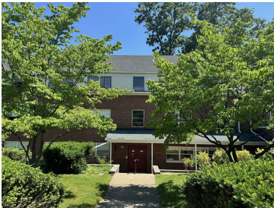
Nutley Preschool Annex at St. Pauls