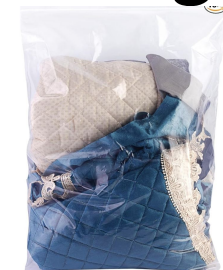
Jumbo Ziploc bag