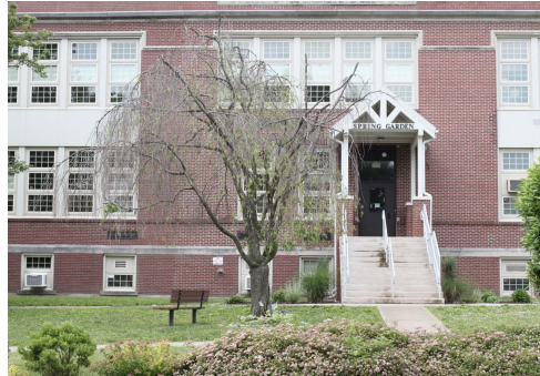
Spring Garden School