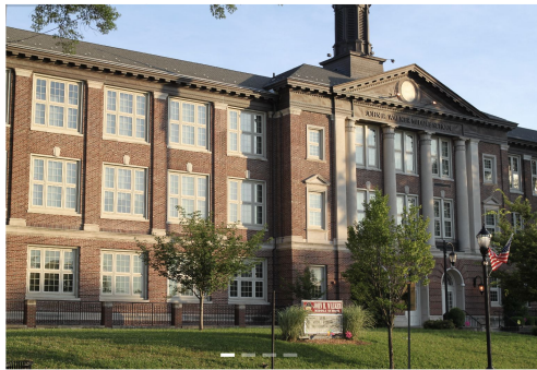
John Walker Middle School